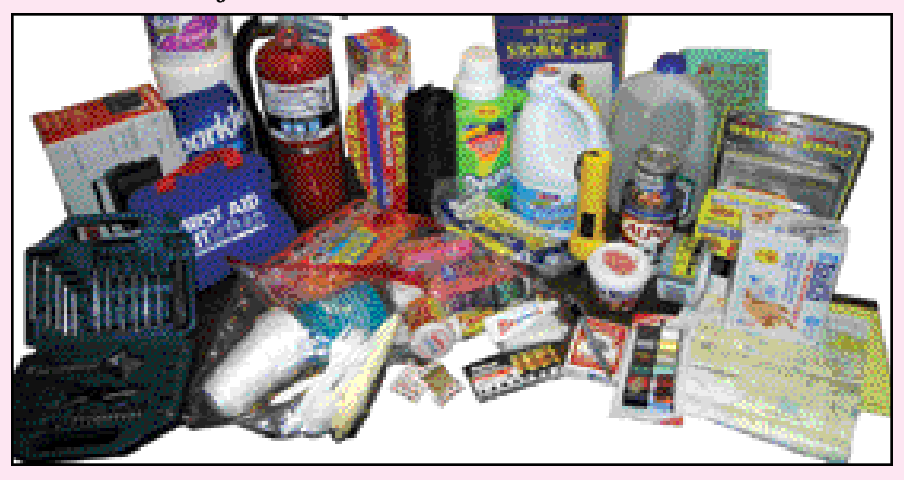
For a more detailed list, contact your local American Red Cross or Emergency Management Agency.