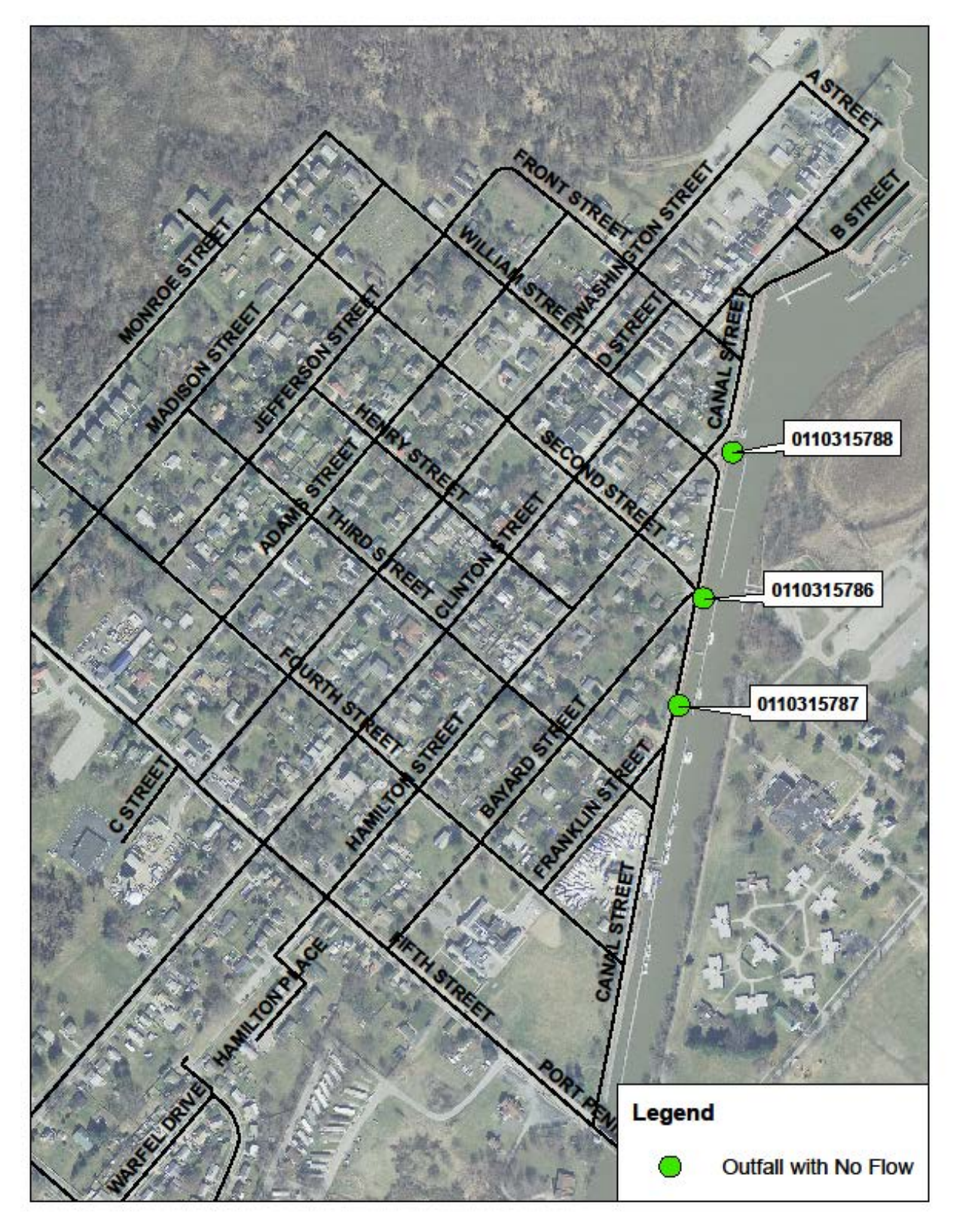
FIGURE 1 2018 DRY WEATHER OUTFALL FIELD SCREENING – OUTFALL LOCATIONS